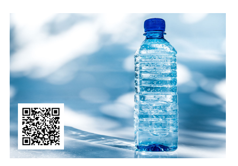
Got questions? Snap here to email us.