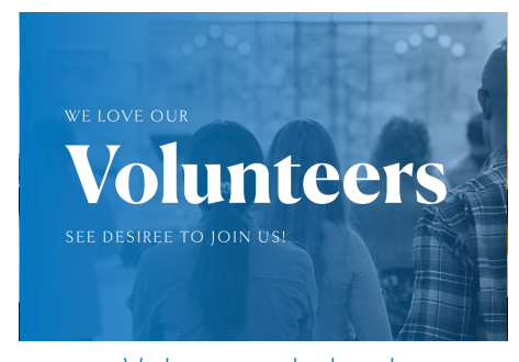
We love our volunteers!

All students and their families are invited to participate.