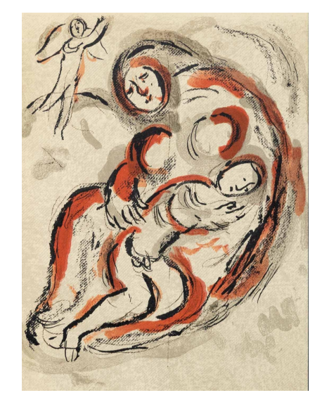
"Hagar in the Desert" by Marc Chagall