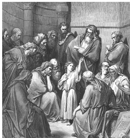
“JESUS WITH THE DOCTORS” BY GUSTAVE DORÉ (1832-1883)

34 Then he looked at those seated in a circle around him and said, “Here are my mother and my brothers! 35 Whoever does God’s will is my brother and sister and mother.”